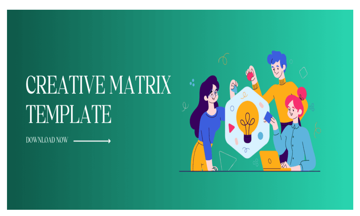
Free Creative Matrix Template